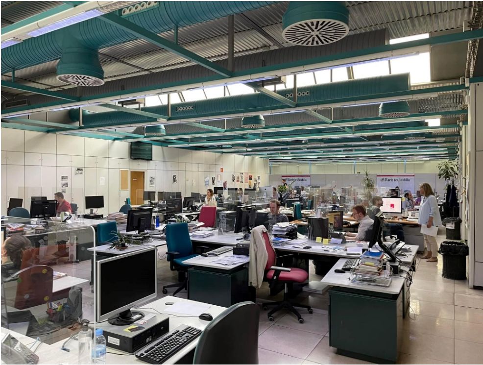
The oldest Spanish newspaper "News Room"