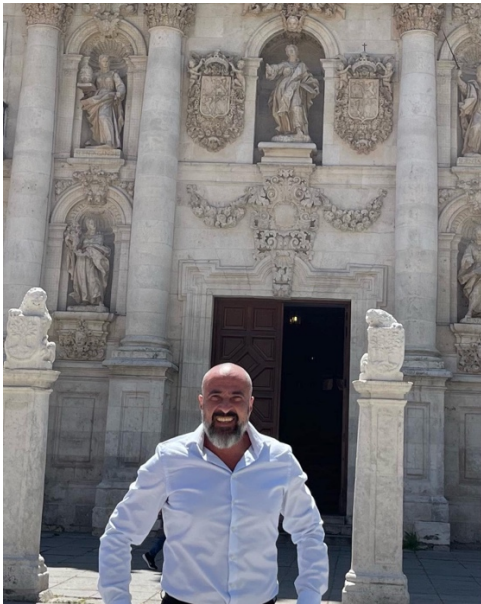
The historic building of the University of Valladolid