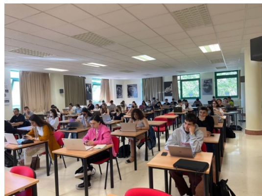
Spanish students at a lecture