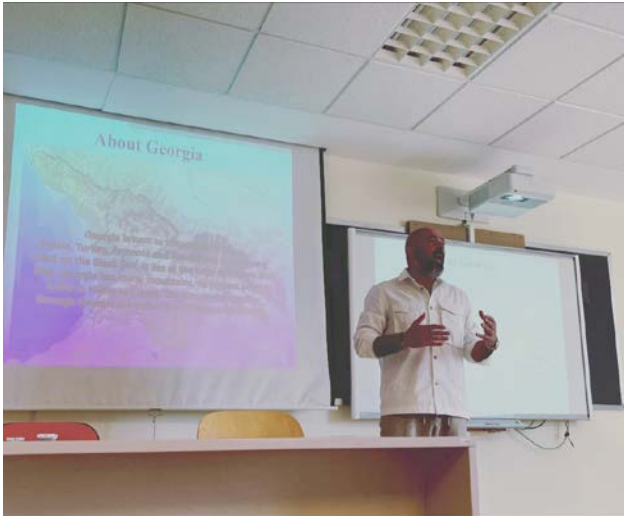
At the beginning of the lecture course, talking to the students about Georgia and Georgian education system.