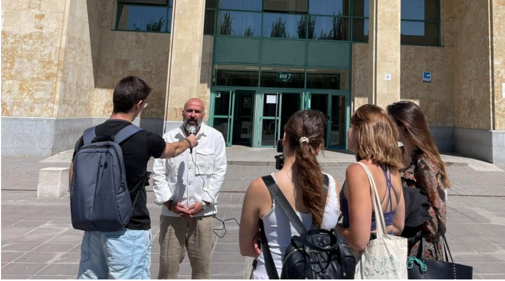
The process of preparing a program with journalism students