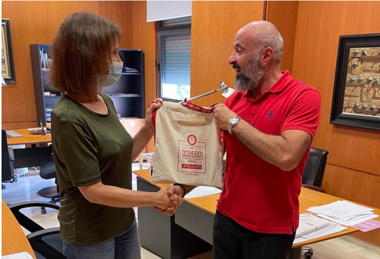
Meeting at the Office of International Relations