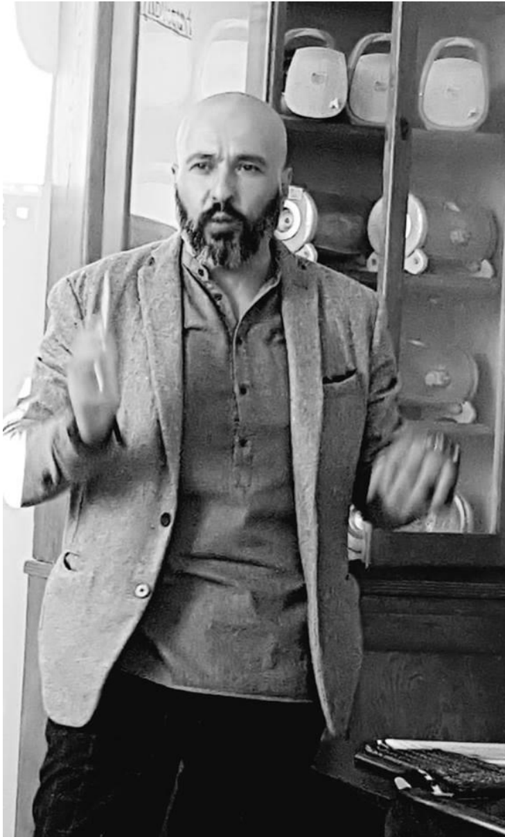
Talking about importance of blended learning

5-day-training course has been recently attended by 36 lecturers from GTU 7 different departments of 3 Faculties, including humanities and engineering fields.