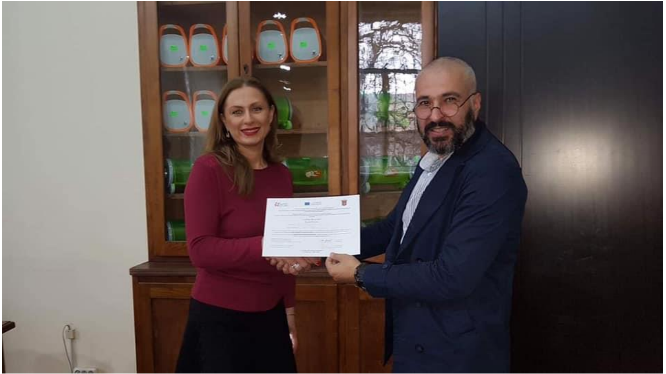
The End of TT training