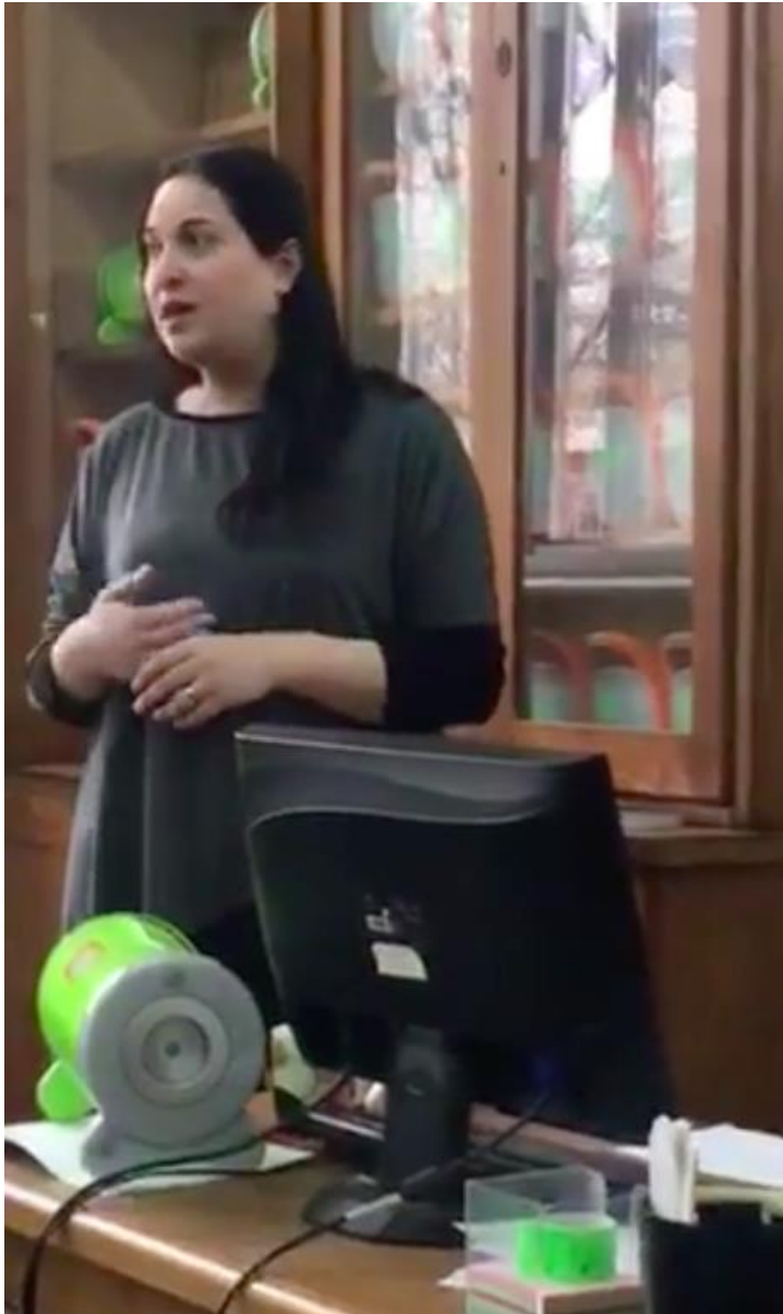
Sharing plans of implementation of new experience

The TT training courses within project PRINTeL at GTU were conducted in partnership with GTU Innovations Center, Center of Teachers' Professional Development, established on the basis of PRINTeL capacity building context.