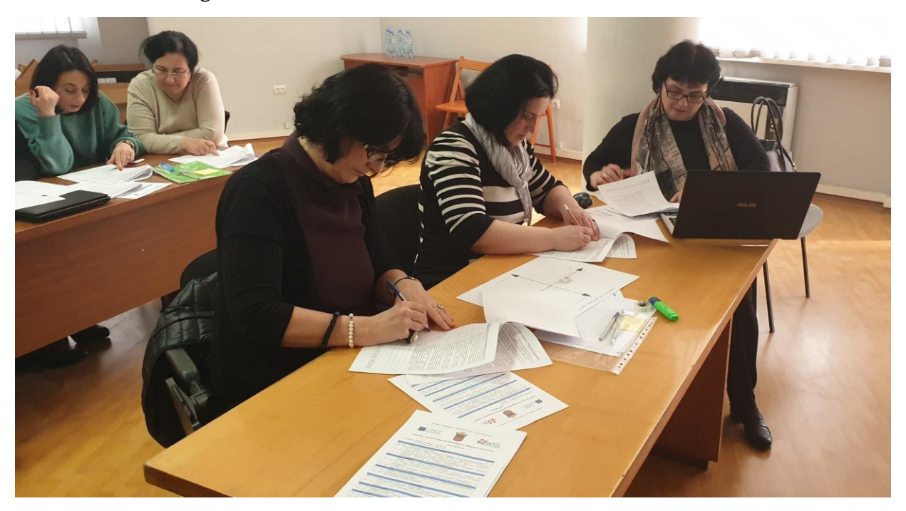
Active Learning Strategies: "Reflecting on Your Practice"

The trainings lasted 5 days, each one with 2 hour-long sessions. 10 sufficiently overloaded and intensive working hours included different activities like sessions and lectures;