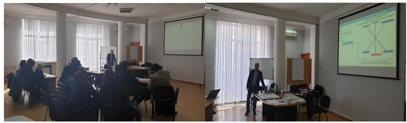
About TT - "Active learning in the Flipped Classroom"

The trainings lasted 5 days, each one with 2 hour-long sessions. 10 sufficiently overloaded and intensive working hours included different activities like sessions and lectures;