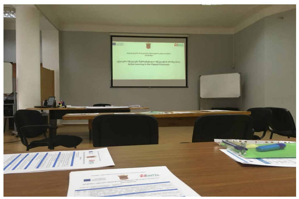
Preparation for the trainings

On 11-15 March, 2019 at Georgian Technical University was conducted Training course on Innovative pedagogy method: Active Learning in the Flipped Classroom Method within the framework of Eurocommission funded Erasmus+ program project PRINTeL – Change in Classroom: Promoting Innovative Teaching & Learning to Enhance Student Learning Experience in Eastern Partnership Countries.