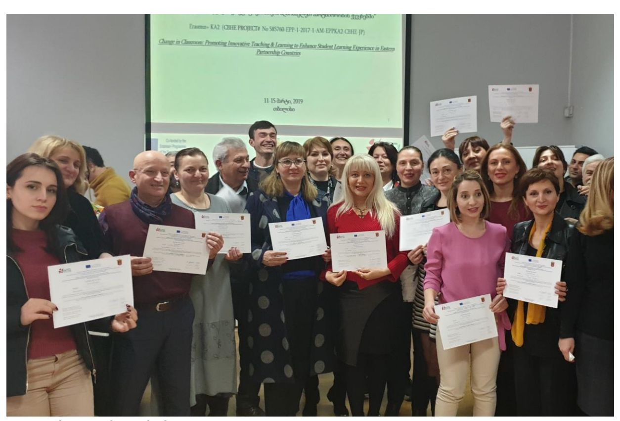
Group photo at the end of training

The trainings were conducted in partnership with Teaching Staff Development Center of GTU Innovations Center (founded on the basis of PRINTel capacity building context) and GTU Center of Professional Development.