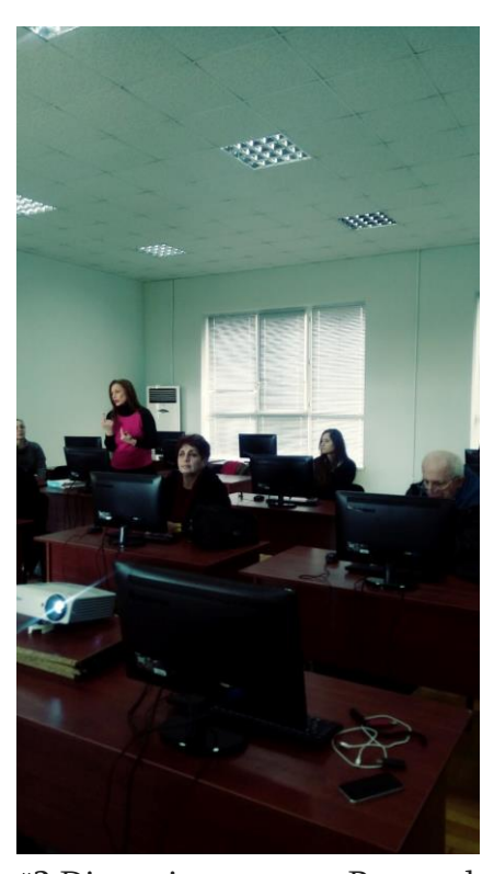
#2 Discussion process: Pros and cons

TT course participants got knowledge about programs: "Explain everything" and "Movie Maker". They participated into the video planning. In order to examine the above-mentioned programs, the participants were divided into groups and worked on the programs. Some of them tried to work themselves. The trainees especially liked the program "explain Everything".