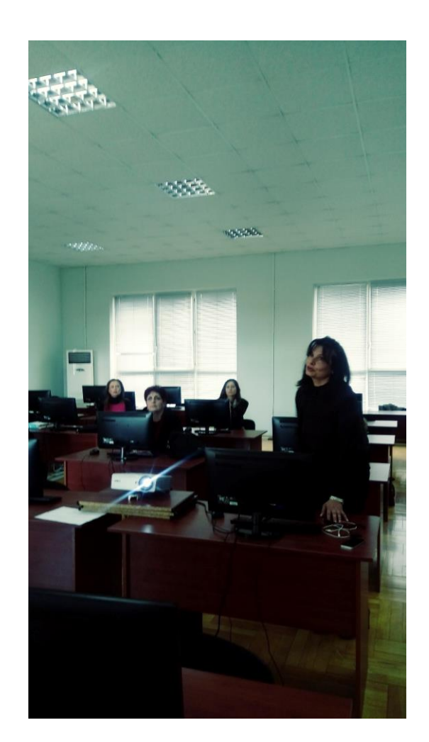
Programs presentation: "Panopto" and "Movie maker" (#6,7,8)