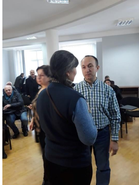
Discussion of Gamification resources and tools

At the final day of training the participants, based on obtained theoretical and practical skills represented renewed approaches of their syllabuses implementing elements of m-learning and gamification.