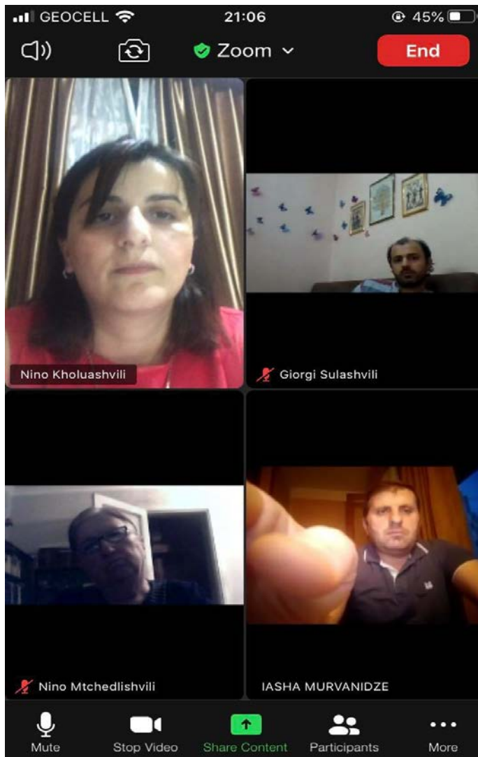
Pic. 3. Participants actively participated in the open discussion

chance to work in different online platforms like Moodle, Trello, Google Sites and etc., they also were introduced to basics of applying multimedia tools like editing videos in EdPuzzle.