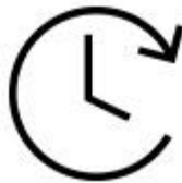
Just in time